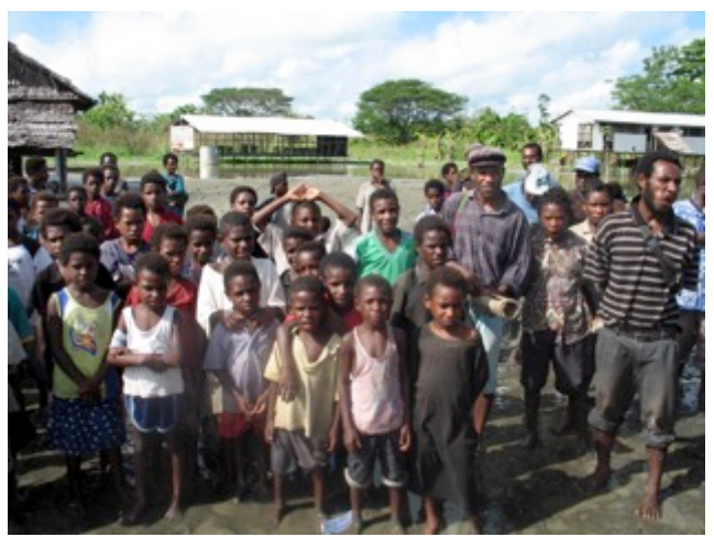
The 240 school children sang the National Anthem and recited the pledge. There were speeches and presentations but we were all overwhelmed by the generosity of these people with so little who showered on us so many precious gifts. The

When our "Miss Rankin" party arrived at school ground there were more than 1000 people gathered on the mud flat. The school children were all lined up and ceremonial dancers performed.