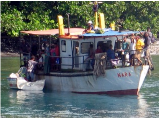
Day 9 Thursday, 25<sup>th</sup> May Tami Islands

Returning to the boat the anchor was up at 10.35pm and we were away to.... Somewhere... I guess you will need to look at tomorrow's diary to find out where.