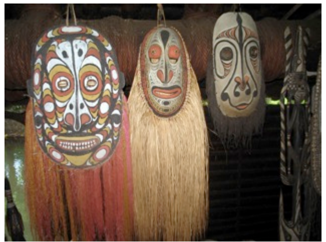
Day 5 Sunday, 21<sup>st</sup> May Sepik River — Palembei & Minimbit

Sundays' dawn revealed the Miss Rankin sitting easily at anchor in a slower flowing section of the Sepik. A gentle breeze was clearing the cloud responsible for the previous night's rain. All good omens that the spirits were happy for the whiteman (dim dim) to attend Palembei.