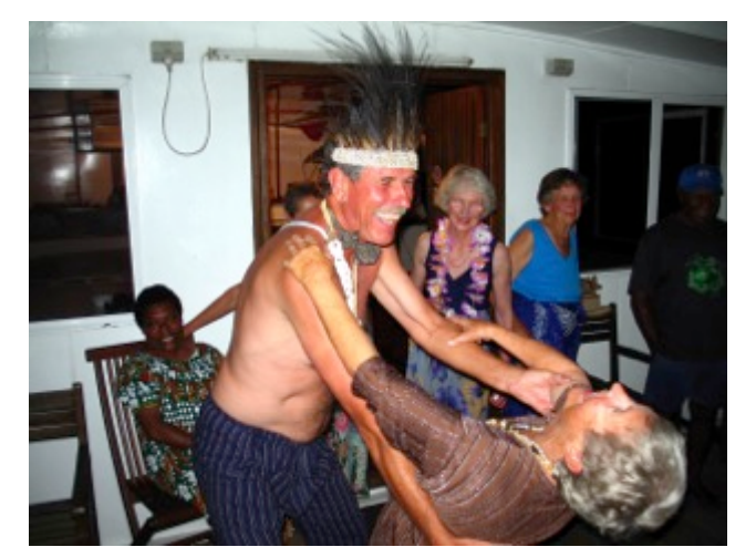
Day 15 Wednesday, 31<sup>st</sup> May Dobu Island and Boia Boia Waga

The ship's company had to await with great anticipation Sir Longnose arising so that they could see the captured dragon the noble night warrior had literally caught before ascending to slumber. It proved to be beautiful sight and with that Sir Longnose taming the wild creature before being consigned to shore in the long boat. "Miss Rankin" then rapidly weighed anchor and for awhile it appeared that the ship's commander might be trying to be well rid of the troublesome Intrepid Guide but our nocturnal warrior followed in hot pursuit and overtook us before we reached Dobu Island.