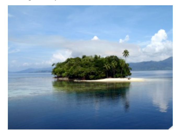
Day 12 Sunday, 28<sup>th</sup> May Cape Nelson & Tufi

A grey dawn and wide ocean views greeted those hardy early risers and we had our first daylight rain storm. Mt Trafalgar and Victory gradually came into view.