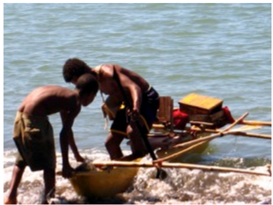
Day 8 Wednesday, 24<sup>th</sup> May Saidor Plantation

PNG the land of the unexpected continues to live up to its reputation as we sit here tethered to Captain Cus Cus Collins' backyard, EDT 0100 hours, crew uncertain, Nolai possibly off to another job, tenders changed, Anne Collins farewelled and Saidor and a Maroon Blues barney in the offering. ALL GOOD.